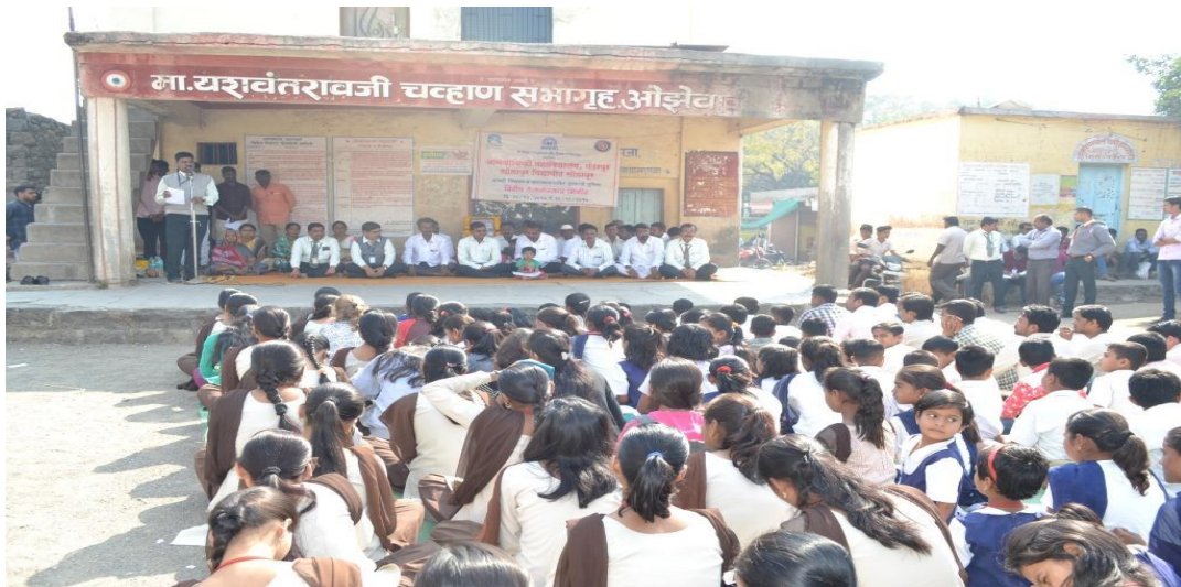
Closing ceremony of NSS camp