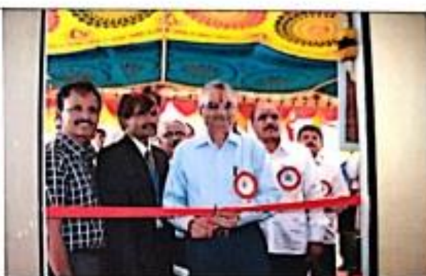
Inauguration of NKN Application Centre in SVERI campus