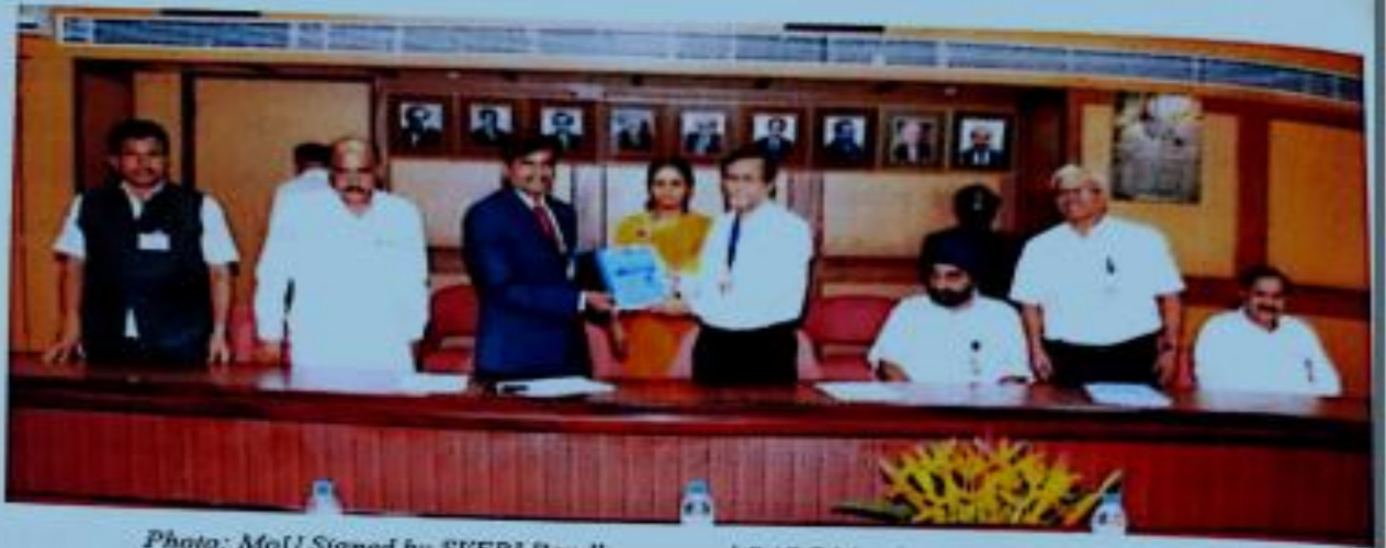
Photo: MoU Signed by SVERI Pandharpur and BARC Mumbai on 15 September 2011